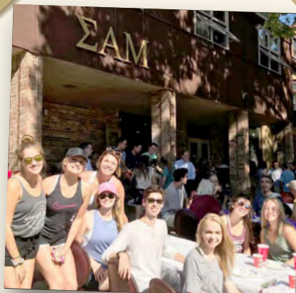
The Kappa Chapter (University of Minnesota) held its annual Breakfast at Sammy event to raise funds for Alzheimer's research and care. Serving donated food from local eateries, they raised $2,400 in one day from over 350 ticket sales, raffles and donations.