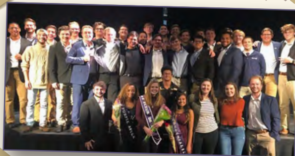
The Delta Eta Chapter (University of West Florida) held the third annual Ms. Fleur-de-lis Pageant and raised $4,000 in support of The Judy Fund.