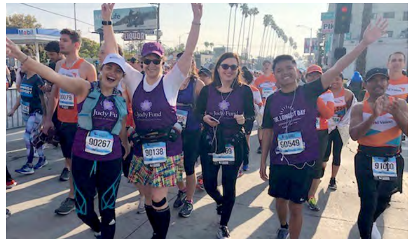
Members of Gelfand, Rennert & Feldman at the LA Marathon.