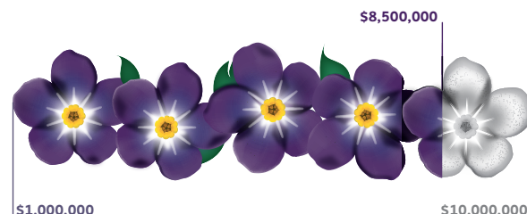
Progress toward The Judy Fund goal of $10 million by 2020.

Today The Judy Fund has raised and granted over $8.5 million, on our way to our goal of $10 million by the end of 2020. Our fundraising capacity mirrors the growth of funding for Alzheimer's worldwide: In the last five years, federal government funding of Alzheimer's research has more than quadrupled to $2.4 billion. That's the combination of drive and passion that is going to get us all to Alzheimer's survivorship.