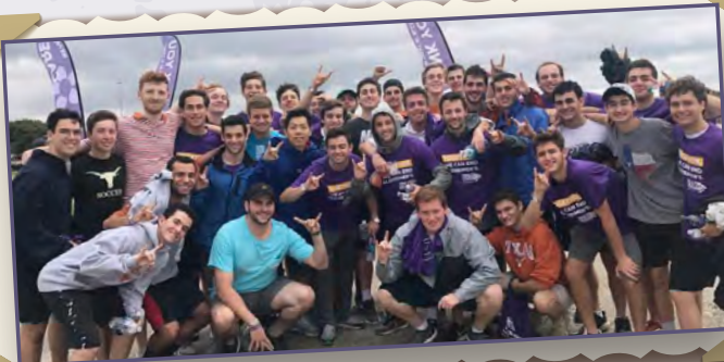
Team Texas Sammy, captained by the Sigma Theta Chapter (University of Texas at Austin), raised $6,213 at Walk to End Alzheimer's, marking their second consecutive year as the top fundraiser for The Judy Fund's Walk to End Alzheimer's National Team.