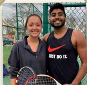
The Mu Psi Chapter (Miami University of Ohio) held the "Oxford Open" tennis tournament last spring with help from peers on campus.