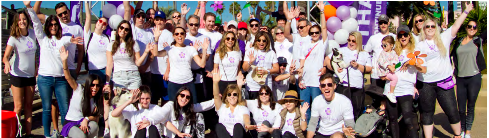
The Judy Fund team at Walk to End Alzheimer's in Santa Monica, California.

Each year, The Judy Fund unites people from across the country as they raise funds and awareness on behalf of a “Judy” in their lives. Once again, The Judy Fund supporters exceeded expectations at multiple events in their relentless fight against Alzheimer's disease.