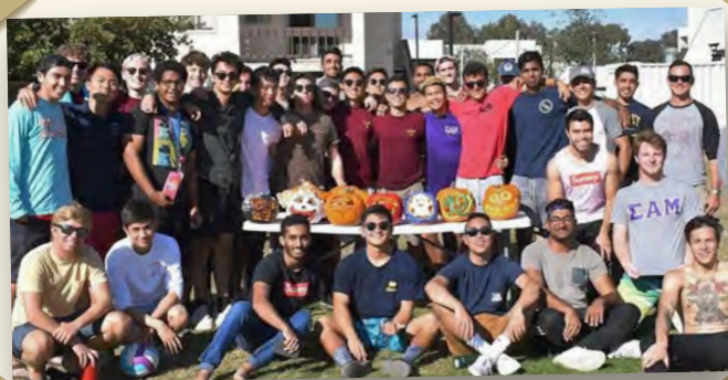
The Gamma Rho Chapter (University of California, San Diego) hosted a pumpkin-carving contest during their Sammy Scarefest in November 2018.

Please join us in celebrating the 2018-2019 academic year's top five fundraising chapters: