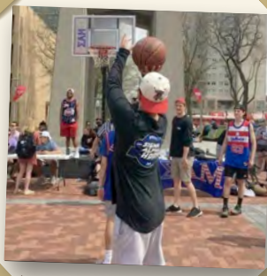
The Gamma Psi Chapter (Temple University) hosted the inaugural Sigma Alpha Hoops, a March Madness-style tournament that raised $3,000.