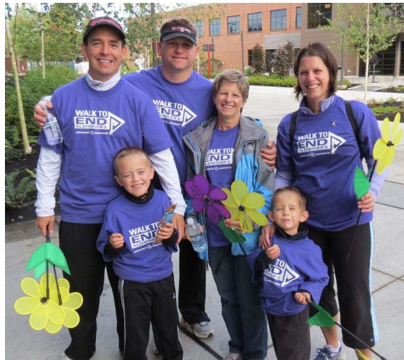
The Rebels Team at the Everett Metro Walk.

Think you're unhealthy? You could be right, and your brain may be trying to tell you something. A new study shows that people aged 65