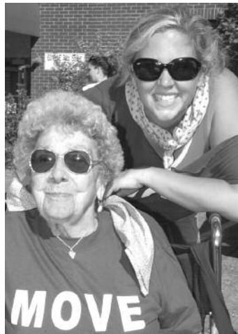
Thousands of individuals from across generations turned out for Memory Walk 2008!

The fundraisers listed below were recognized based on totals received on the Walk day. Numbers may vary based on donations received after the Walk.