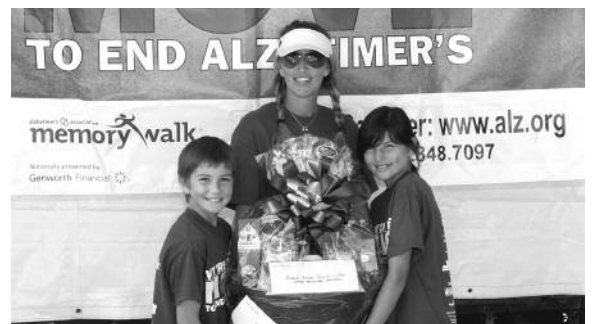
Right: The Bray Team, 38 walkers strong, raised more than $16,200 this year! In two years, they've raised over $33,000.