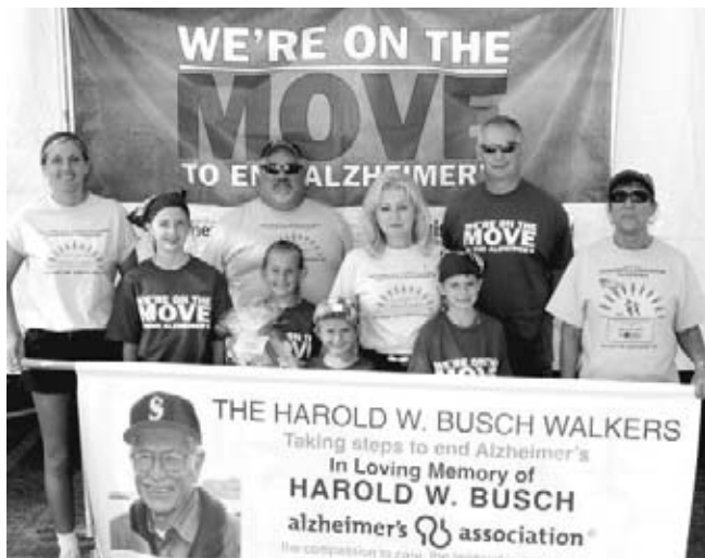
Above left: The Harold W. Busch walkers raised $16,000. They've contributed more than $67,000 since 2005.