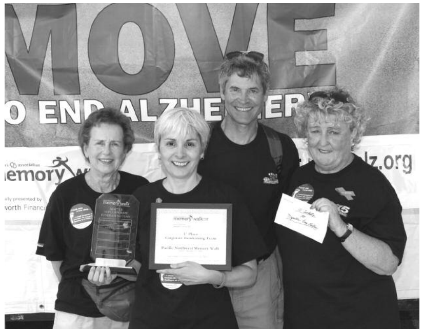
Above left: The Highgate Senior Living team travelled all the way from Yakima and raised over $7,200.