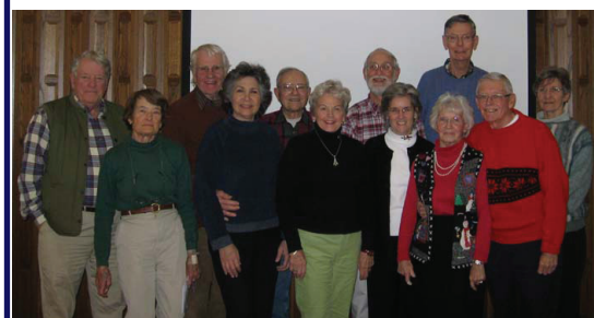
Charlottesville Early Stage Group participants