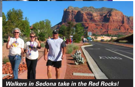
Walkers in Sedona take in the Red Rocks!