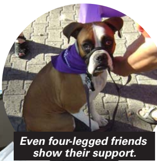
Even four-legged friends show their support.

Each person can write a message on their promise flower to further strengthen their dedication. We will then honor this mission in a ceremony prior to the Walk. Afterwards, the Flowers create a dynamic, colorful and meaningful garden walkers will enter as they conclude their Walk.