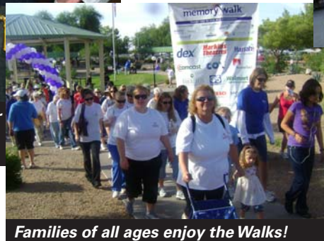
Families of all ages enjoy the Walks!