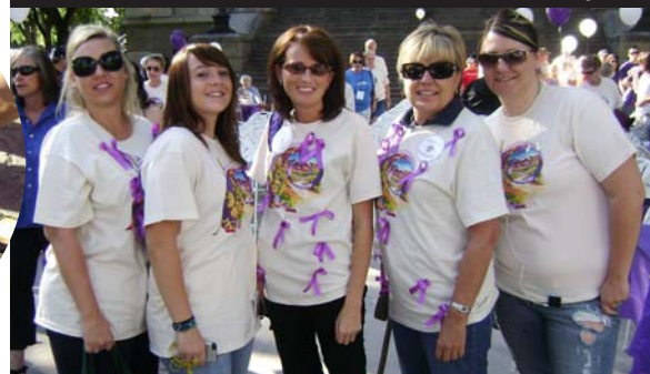
Ask families, friends & coworkers to walk with you!