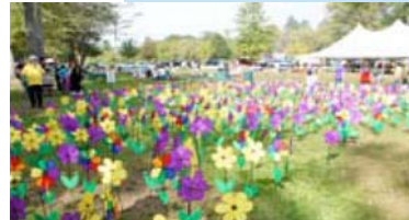
The Promise Flowers create a powerful garden after the Walk.

This year marks the beginning of a new element to our Walk: the Promise Garden . Through the Garden, Walk participants will come together, making a commitment to fulfill their promise to remember, honor, care and fight Alzheimer's disease.