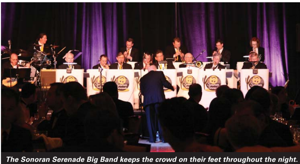
The Sonoran Serenade Big Band keeps the crowd on their feet throughout the night.