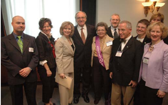
Staff and volunteers from the Big Sioux, East Central Iowa and Greater Iowa Chapters visited with Senator Tom Harkin during the Public Policy Forum in May.