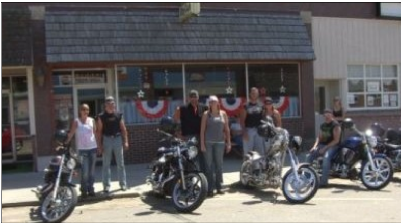
Poker Run Fundraiser

Fiscal Year July 1, 2009 - June 30, 2010