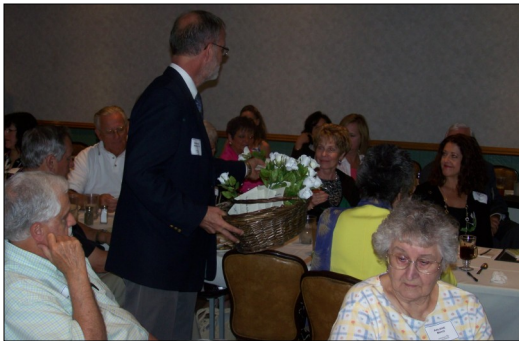
Volunteer Appreciation Lunch