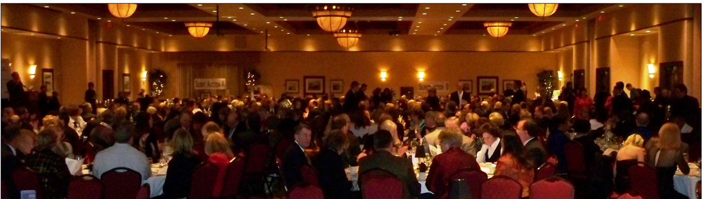
Stars Are Out Gala

When someone you love becomes a Memory , their memory becomes a Treasure .