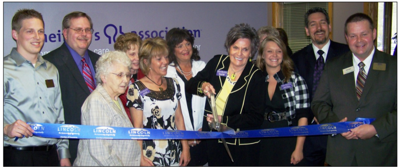
Ribbon Cutting for New Chapter Office