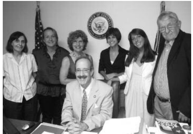
Alzheimer’s Association advocates met with Congressman Eliot Engel in his District Office earlier this year.

Together, we can make sure the NYS Legislature and our Federal legislators hear our voice and work toward a world without Alzheimer’s.