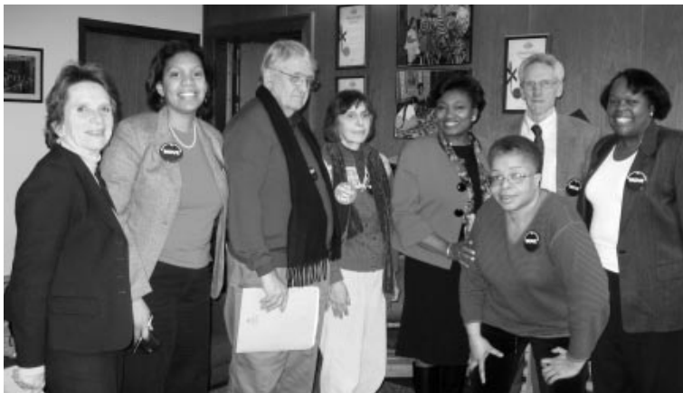
Advocates meet with NYS Senator Andrea Stewart-Cousins, 4th from R

This year we were 40 strong! On a cold but sunny February day, early-stage individuals, caregivers, Board members, volunteers and staff rode together to Empire State Plaza in Albany, where we rallied alongside others representing the New York State Coalition of Alzheimer's Association Chapters.