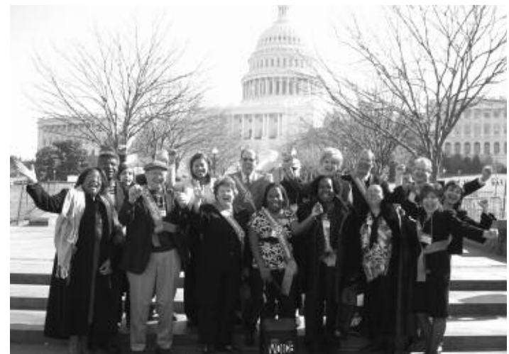
Twenty-two advocates from our Chapter stormed Capitol Hill during the Alzheimer's Association's 2010 Advocacy Forum.