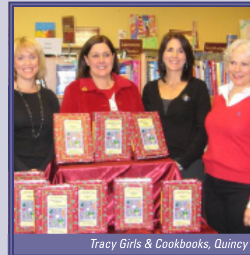
Tracy Girls & Cookbooks, Quincy