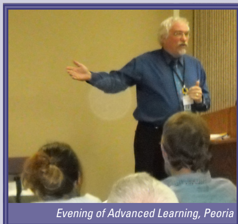
Evening of Advanced Learning, Peoria