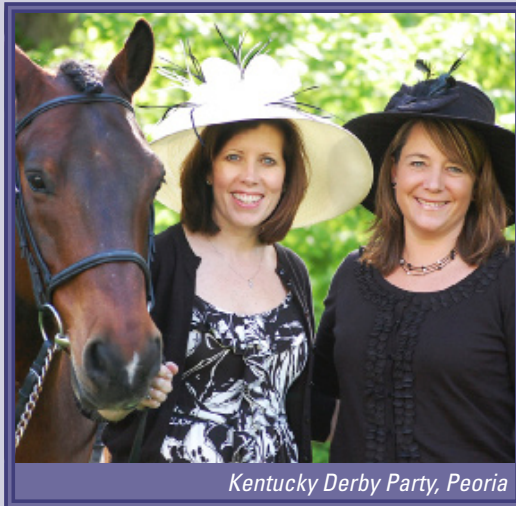
Kentucky Derby Party, Peoria