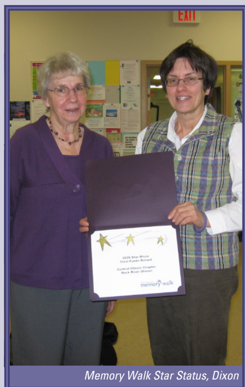
Memory Walk Star Status, Dixon