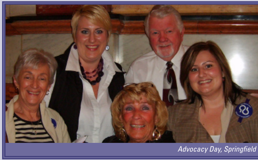
Advocacy Day, Springfield