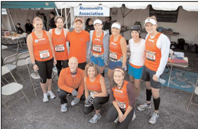
Above: ALZ Stars full marathon team on race day. Below: ALZ Stars half marathon team at the team tent.

For information about the 2011 ALZ Stars programs, call 1.800.272.3900 or email info.maryland@alz.org