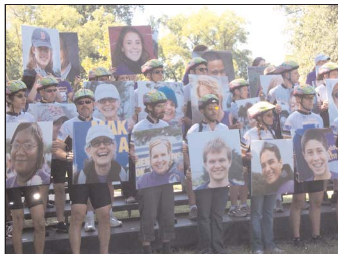
The Breakthrough Riders sport their "brain helmets" as they show the many faces of those affected by Alzheimer's.

Many thanks to all of the volunteers who traveled to Washington, D.C. to support the Breakthrough Riders as they finished their journey across the country to raise money and awareness of Alzheimer's.