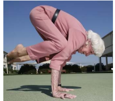
Modest but regular physical activity such as yoga protects against heart disease and certain cancers.

This New Year, most of us have good intentions of getting more exercise and eating a better diet. For people living in the Blue Zones, this is not a New Year's resolution, but a way of life.