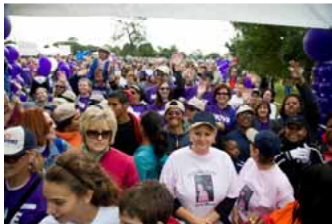
A record 800 Mississippians walked in 2008

Memory Walk is a community driven event. It is about families, friends and communities coming together and uniting around a