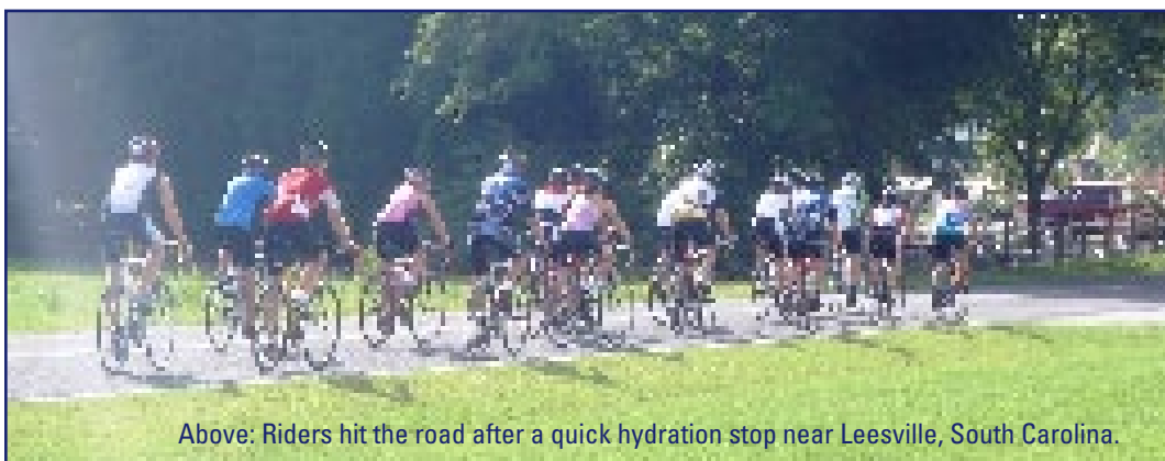
Above: Riders hit the road after a quick hydration stop near Leesville, South Carolina.

Planning is underway for A Ride to Remember 2011. To learn more about riding or volunteering, please contact Ashton Houghton at 1-800-860-1444.