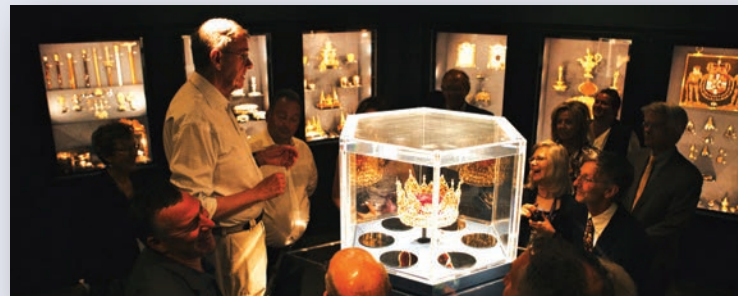
Global Immersion guests enjoy a private viewing of the Danish crown jewels.

Researchers report that incidence and prevalence of Alzheimer's disease in developing countries such as Colombia and large regions of Asia and Africa may be severely underreported. Additional work is needed to clarify these seemingly contradictory findings.