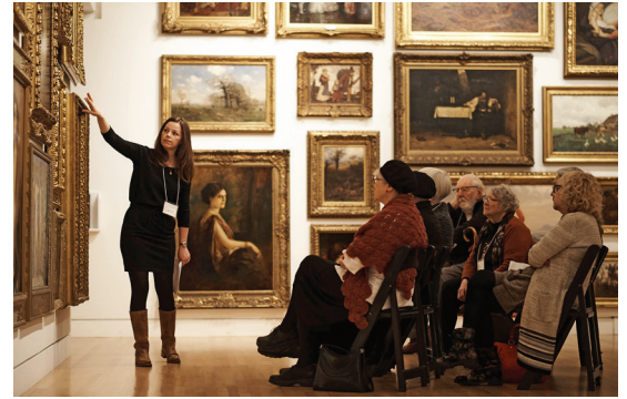
Frye Art Museum.

Here in Washington state, we're seeing the growth of programs that empower people with memory loss and their families to stay active and connected in the community – from Alzheimer's Café gatherings at local coffee shops, to art gallery tours at the museum, to walks at the zoo. The photos of dementia-friendly programs displayed here are part of a larger exhibit organized by the Alzheimer's Association for their 2018 Discovery Conference. They serve as a reminder that people with memory loss remain a vital part of the community and deserve the opportunity to stay engaged. View more programs at momentiaseattle.org or alzcafes.org .