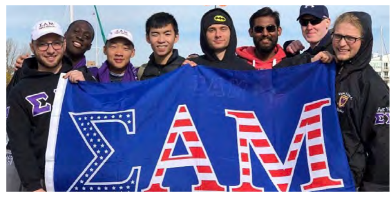
Brooklyn College Mu Upsilon Chapter at Walk.