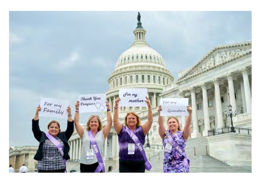
Ambassadors and advocates gather on Capitol Hill prior to meeting with their elected officials.

Ambassadors are playing a crucial role in creating momentum behind one of the Association's top legislative priorities, the Building Our Largest Dementia (BOLD) Infrastructure for Alzheimer's Act. This legislation would establish Alzheimer's Centers of Excellence nationwide to expand and promote the evidence base for effective Alzheimer's treatments, and issue funding to state and local public health departments to promote cognitive health, risk reduction, early detection and diagnosis, and the needs of caregivers. In addition, the BOLD Infrastructure for Alzheimer's Act would also increase collection, analysis and timely reporting of data on cognitive decline and caregiving to inform future public health actions.