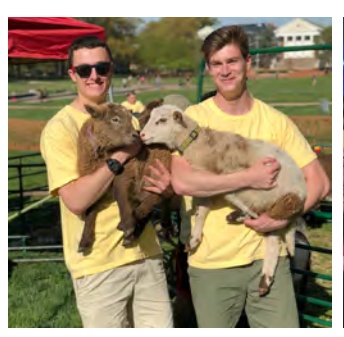
Chapter's Sigma Alpha Zoo event.

Beyond Walk, other autumn activities showcased members' creativity and signature spirit. SUNY Purchase's Epsilon Omicron Chapter hosted pumpkin carving during Jacks 4 Judy. University of California, San Diego took competitors to the beach for Sammy Sandcastles 2K17. Florida International University's Delta Zeta Chapter teamed up with their sorority peers on a fundraising pageant to crown the 2018 Miss Fleur de Lis. In addition, Sigma Alpha Mu's long-standing tradition of No Shave November — when participants forgo their razors for the cause — raised more than $16,000.