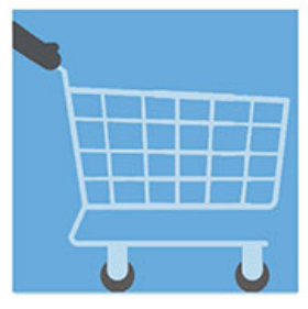
SHOP AT NON-PEAK HOURS