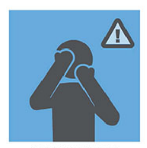
AVOID TOUCHING YOUR EYES, NOSE, OR MOUTH WITH UNWASHED HANDS OR AFTER TOUCHING SURFACES