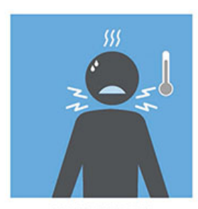
DON'T WORK WHEN SICK