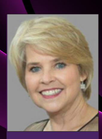
LIFETIME ACHIEVEMENT HONOREE